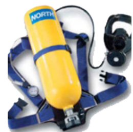
NIOSH Approval #TC-13F Self- Contained Breathing Apparatus (SCBA) Air supplied from a pressurized tank to a full-face mask.