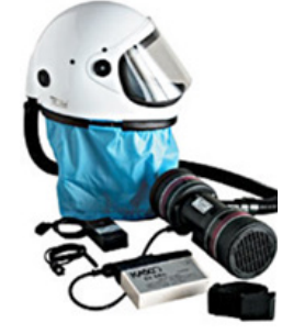
NIOSH Approval #TC-23C Powered Air Purifying Respirator (PAPR) with OV and combination HE filters.

combination N-type particulate filter. NIOSH Approval Air Purifvina